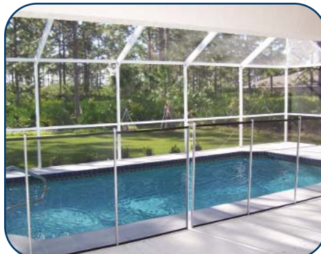
See overleaf for more details